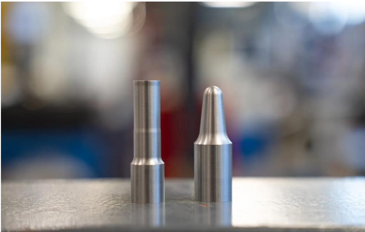
Close-up image of Foundation Alloy molybdenum-alloy forging die

Kanematsu Corporation (“Kanematsu”) announced that it has made an equity investment in Foundation Alloy Technology Explorations, Inc. (“Foundation Alloy”), a U.S.-based startup originating from the Massachusetts Institute of Technology (“MIT”) that develops and commercializes next-generation engineering alloys through MetalsFIRST™, a fully integrated, solid-state metallurgy process. Kanematsu has acquired equity stake in the company by participating in Foundation Alloy’s Series A third-party allocation of new shares. Going forward, Kanematsu will broadly supply Foundation Alloy’s next-generation alloys and parts both in Japan and overseas, enabling faster, simpler manufacturing cycles, capital-efficient industrial scale up, and access to alloy compositions and properties inaccessible to legacy melt processes.