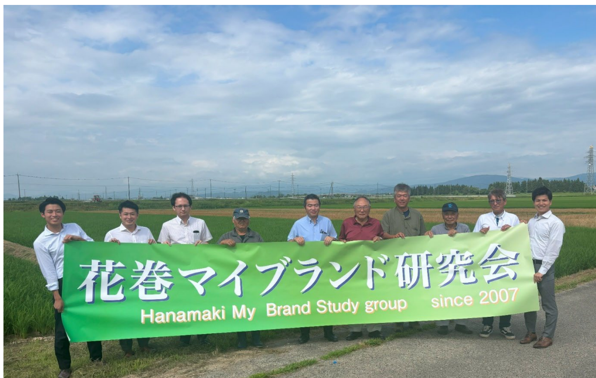
Stakeholders at the Producers’ rice paddy in Hanamaki

This was made possible through cooperation and collaboration with the following diverse stakeholders committed to supplying sustainable domestically produced rice: Skylark, a downstream company in the supply chain; Raizu Michinoku Corporation (“Raizu Michinoku”), a rice distributor; Agricultural producers’ consortium Hanamaki My-Brand and Agricultural producers’ cooperative corporation Kizuna (“Producers”), rice producers; and Green Carbon, Inc. (“Green Carbon”), responsible for environmental value creation.