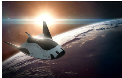
Dream Chaser Spaceplane

Japan Airlines Co., Ltd., Kanematsu Corporation, Oita Prefecture, MUFG Bank, Ltd., Tokio Marine & Nichido Fire Insurance Co., Ltd., Sierra Space Corporation, and Space Port Japan Association have been participating in a partnership to explore the use of the Dream Chaser® spaceplane and are working together to utilize Oita Airport as an Asian base for the Dream Chaser spaceplane.